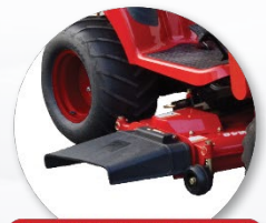
OPTIONAL MID MOWER