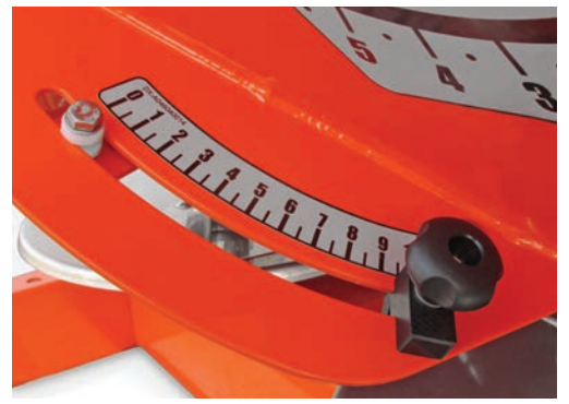
Distributor for the quantity of fertilizer to be spread